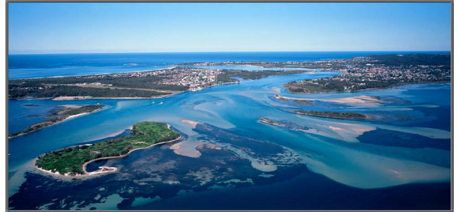
The Drop Over